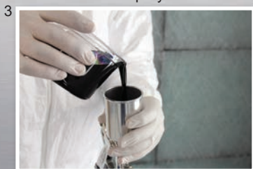
Fill HVLP Spray Gun